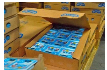
Two products, each one 50gr and 100 gr 100 gr in 1 layer per tray (2x3) x1 50 gr in 2 layer per tray (2x3) x2

The yoghurt pots are sealed with sealing foil through the packaging line and packed in two different formats and in two different layers and weights. Production speed sums up for 2 x 30 trays per minute being the 100gr pots and 2 x 15 trays per minute being 50gr pots. In total 21.600 pots per production hours are packed in trays.